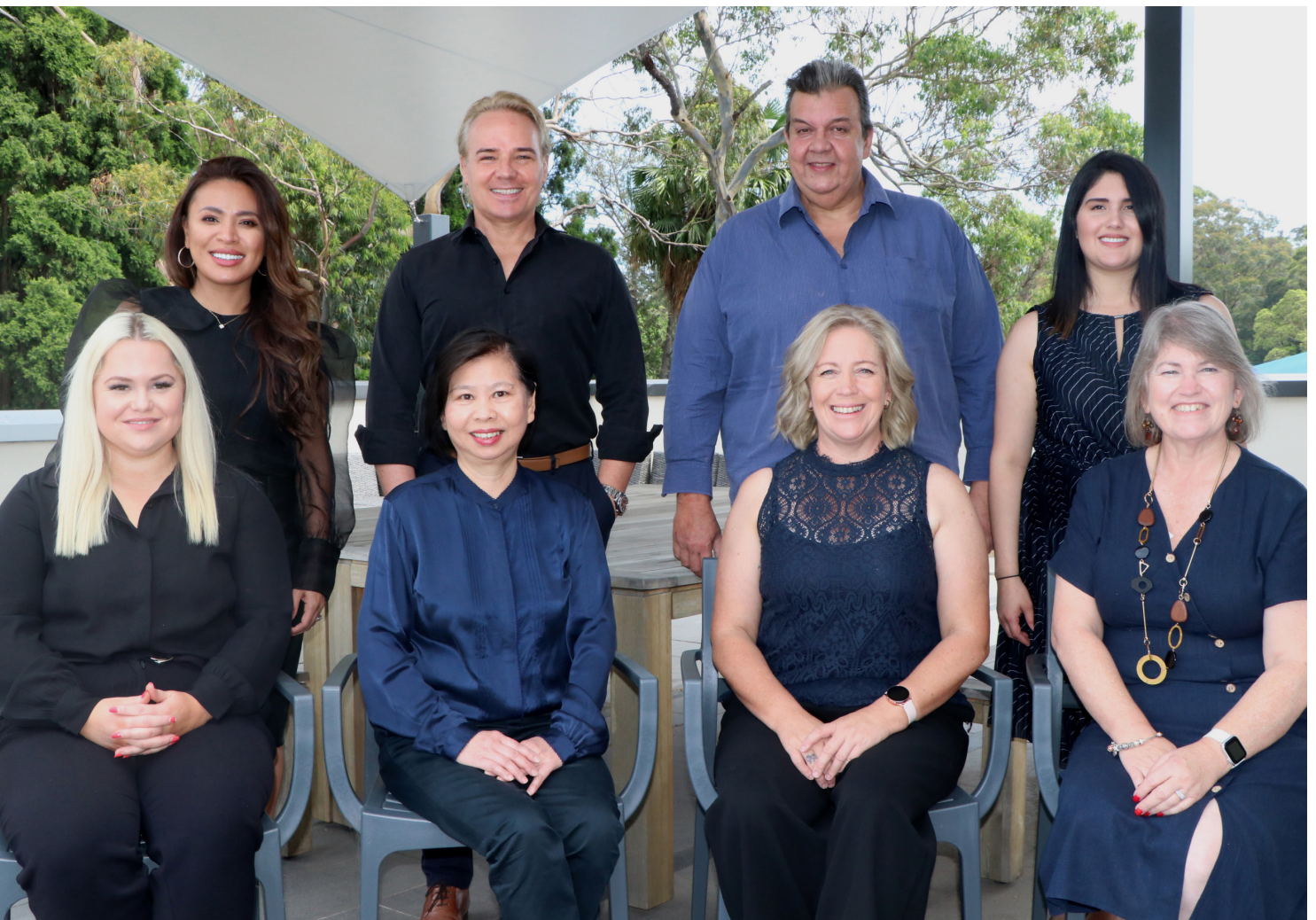
Link Wentworth's Affordable Housing Team

If our staff have exceeded your expectations or you find a process helpful, let us know by telling your Affordable Property Manager. It helps us to build on our strengths.